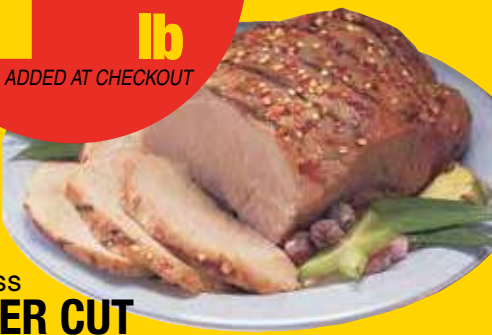
BONELESS CENTER CUT PORK LOIN HALF