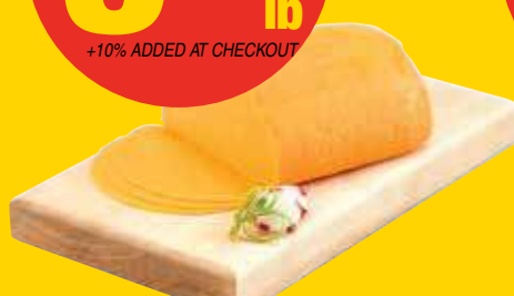
WALNUT CREEK COLBY CHEESE