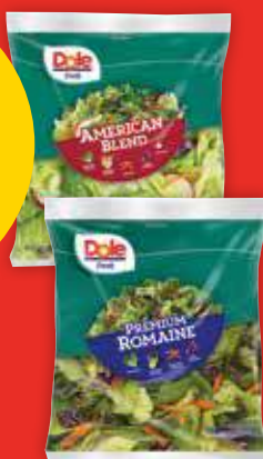
DOLE SALAD BLENDS 5 - 12 OZ. SELECT VARIETIES