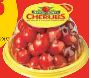
CHERUB TOMATOES 10.5 OZ.