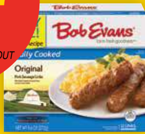
BOB EVANS COOKED LINKS OR PATTIES 9.6 OZ. SELECT VARIETIES