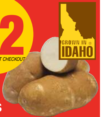
IDAHO POTATOES 3 LB.