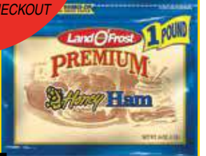
LAND O'FROST PREMIUM LUNCHMEAT 10 - 16 OZ. SELECT VARIETIES