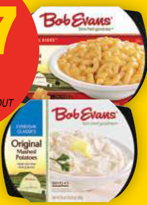
BOB EVANS MASHED POTATOES OR SIDES 12 - 24 OZ. SELECT VARIETIES