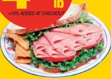
KRETSCHMAR HAM OFF THE BONE