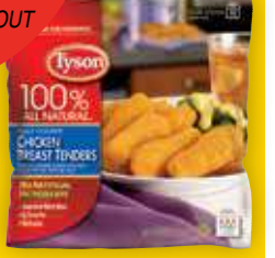
TYSON BREADED CHICKEN 20.5 - 32 OZ. SELECT VARIETIES