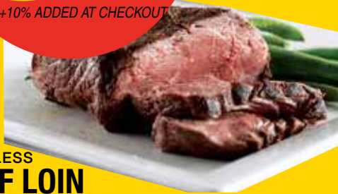
BONELESS BEEF LOIN SIRLOIN STEAK