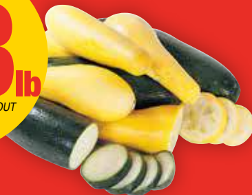
YELLOW SQUASH OR ZUCCHINI