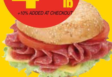
KRETSCHMAR HARD SALAMI