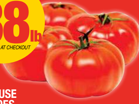
HOT HOUSE TOMATOES