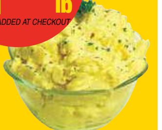
MY PREMIER MUSTARD POTATO SALAD