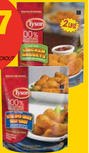
TYSON BREADED CHICKEN 20.5 - 32 OZ., SELECT VARIETIES