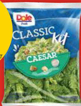
DOLE SALADS 10 - 13.25 OZ. SELECT VARIETIES