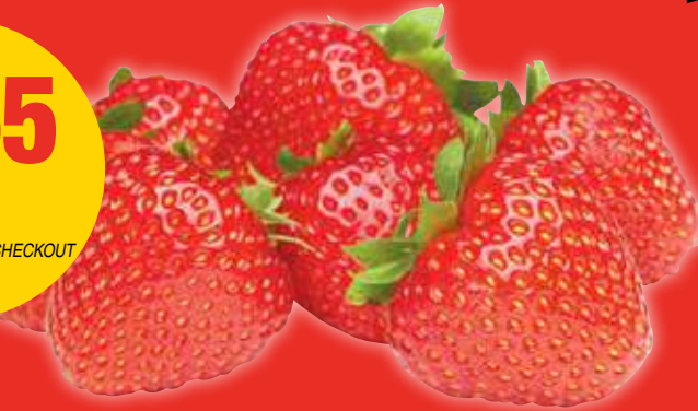
STRAWBERRIES 1 LB.