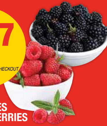
RASPBERRIES OR BLACKBERRIES 6 OZ.