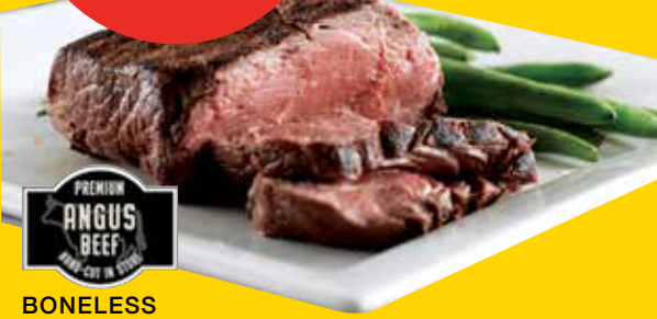
BONELESS BEEF LOIN SIRLOIN STEAK