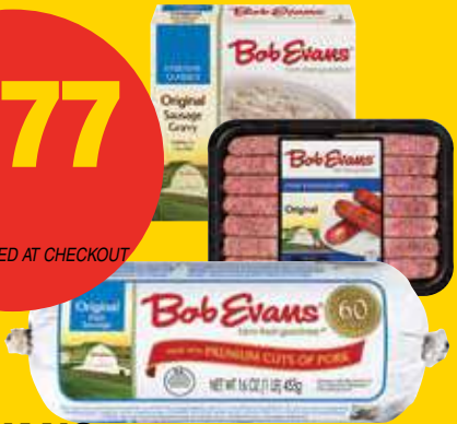
BOB EVANS FRESH PORK SAUSAGE ROLLS, BREAKFAST LINKS OR PATTIES OR SAUSAGE GRAVY 12 - 20 OZ., SELECT VARIETIES