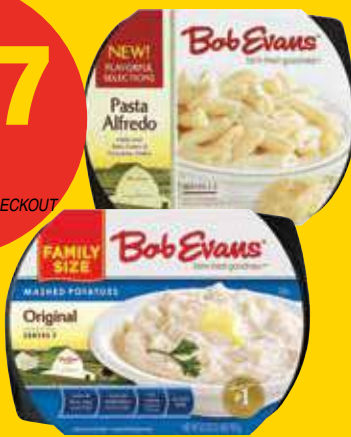
BOB EVANS FAMILY SIZE OR CREAMY PASTA SIDES 20 - 32 OZ., SELECT VARIETIES