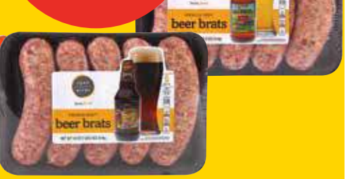
OPEN ACRES BEER BRATS 18 OZ., SELECT VARIETIES