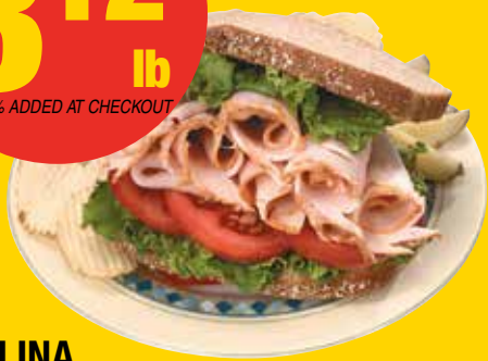
CAROLINA ROASTED TURKEY