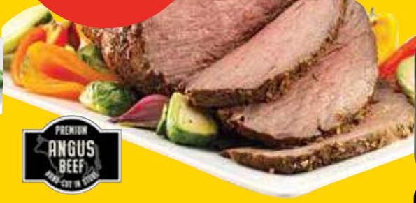
BEEF BOTTOM ROUND ROAST