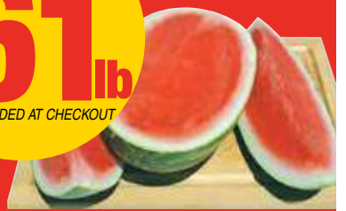
SEEDLESS WATERMELON QUARTERS, HALVES OR SLICES