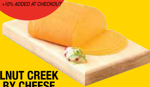
WALNUT CREEK COLBY CHEESE