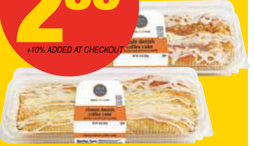
OPEN ACRES DANISH 14 OZ., SELECT VARIETIES